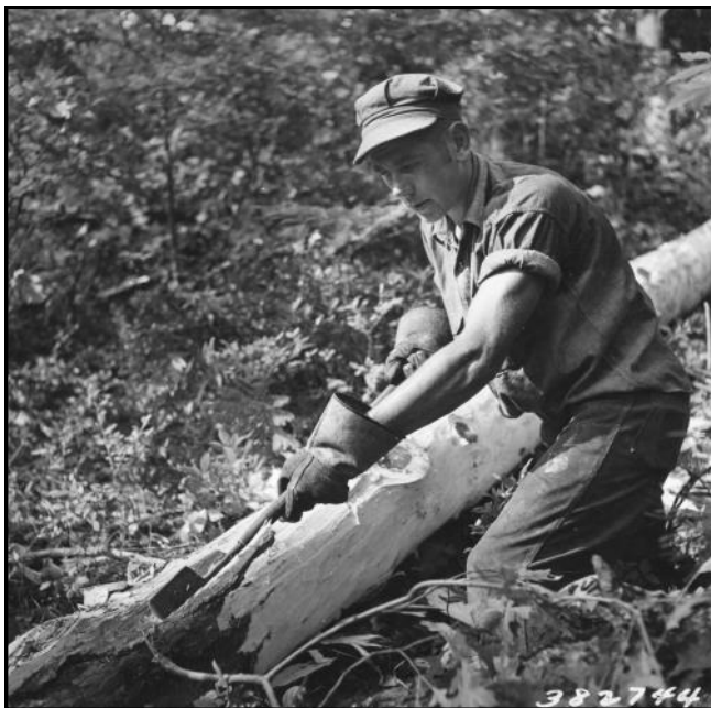
Historically, the Appalachian forests sustained local settlers and provided raw materials for America's economic expansion.

In November, the senators introduced the West Virginia National Heritage Area Act of 2013, which would designate AFHA as a National Heritage Area. The new Appalachian Forest National Heritage Area would include 16 counties in the West Virginia highlands and 2 counties of western Maryland. In addition, the bill extends funding eligibility for the existing National Coal Heritage Area and Wheeling National Heritage Area, also in West Virginia.