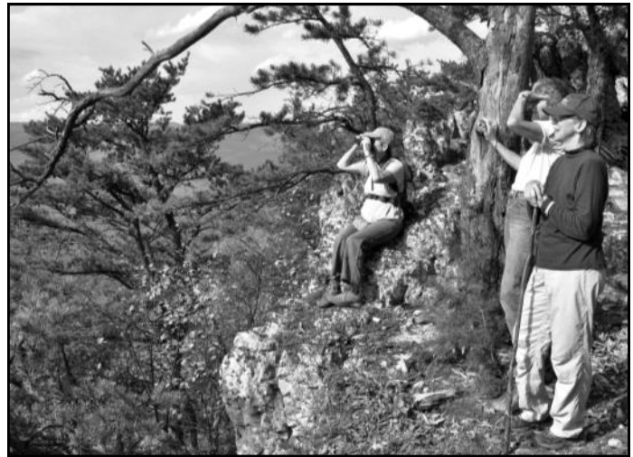
Today the forests remain an inspiration to locals and visitors alike, offering natural beauty, economic opportunity, and recreation.

“West Virginia is one of the most beautiful states in our