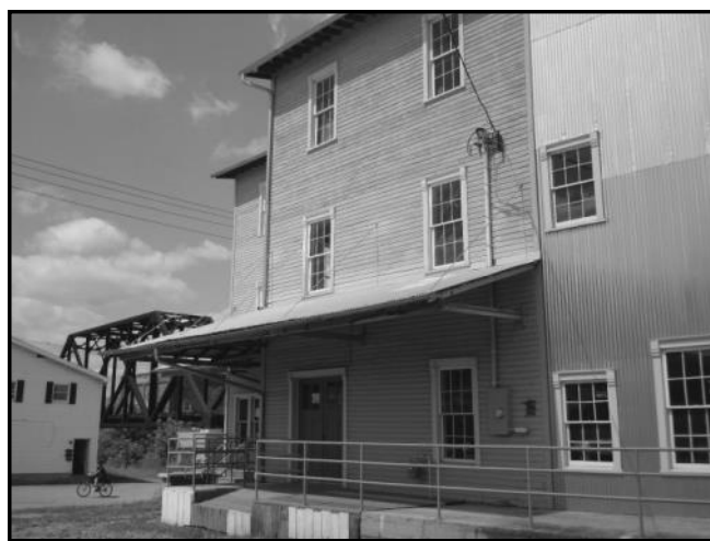
The Darden Mill, at First St. and Railroad Ave. in Elkins, WV