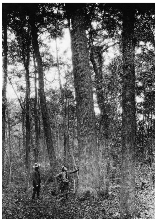
Exhibit Opening: "Discovering the Appalachian Forest"

AFHA is proud to unveil a new exhibit to the public: Discovering the Appalachian Forest . Both modern and historic photos tell the story our forest: its natural splendor, its historic significance, its place in industry, and its influence on local lives and hearts. Come see Discovering the Appalachian Forest for the first time, on display at the Darden Mill in Elkins (2 1/2 Railroad Avenue). There will be an open house on Friday, November 8th from 4pm - 6pm and on Saturday, November 9th from 10am - 4pm. The event is free of charge, but donations are welcome! Questions? Email info@appalachianforest.us . And after the open house, don't forget to come to: