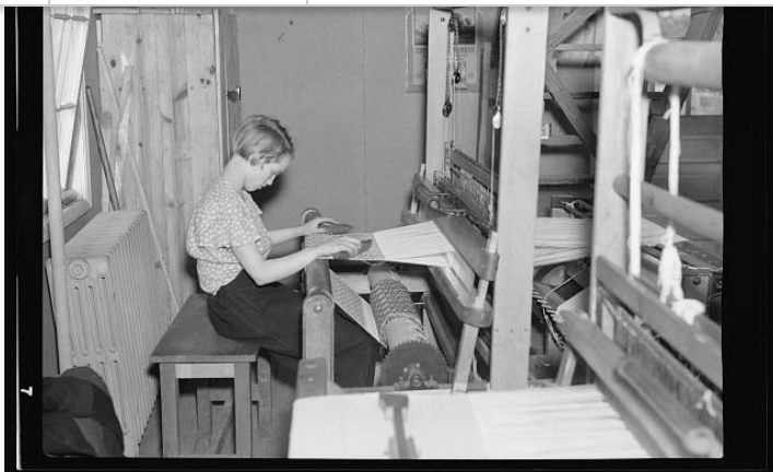
Weaving on one of the cooperative looms at Arthurdale, WV.