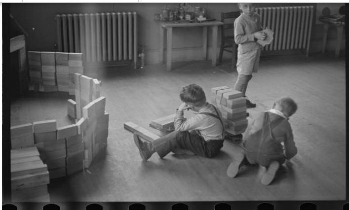
Grade school children in a period of free activity at Arthurdale, WV.