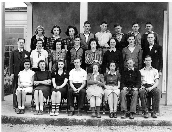
Graduation class at Arthurdale, WV.

Like many AFHA sites, Arthurdale Heritage is a unique place that strives to preserve and share its history. As the first New Deal community started in the midst of the Great Depression, this community was built to assist struggling, unemployed coal miners and their families from Scotts Run, WV. These original families that moved to Arthurdale, called homesteaders, were provided with modern homes (with electricity and running water), two to five acres of land for farming, and training in various trades that could be used to bring in money for the family.