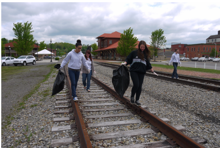
AFHA AmeriCorps members participate in a clean-up project August 7th in Elkins, WV.

The 2014 - 2015 AFHA AmeriCorps year is almost finished and we are grateful to the 38 members who served, a significant expansion of our programs. Of these, 35 are on track to complete their full term of 1,700 hours. Members provided individual service to a wide range of sub-sponsor sites doing conservation, cultural heritage and community development, and historic preservation projects. They also assisted with community service projects, in addition to their service at their sites. Read about the exciting stories of these members and their accomplishments in this and previous e-newsletters at www.afha.us.eneews/htm As these (mostly) young people complete their term and head out to new positions or to graduate school, we thank them for their service and wish them luck in future endeavors.