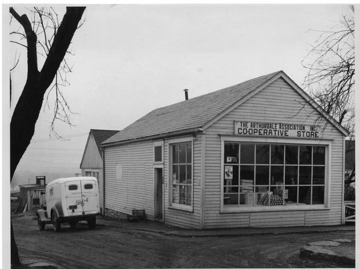
The co-op general store in Arthurdale, WV.

flooding along the Kanawha and Gauley Rivers. There are hunting and fishing opportunities as well as picnic areas and hiking trails. In addition it is a great place for boating (featuring four boat ramps), scuba diving, snorkeling, and rock climbing (there are several sandstone cliffs along the 60 miles of shoreline). The Corps broke with the convention of naming the projects they built after the nearest town, which is this case was Gad, which would have resulted in the name, "Gad Dam." Summersville is the next closest town and so received the name.